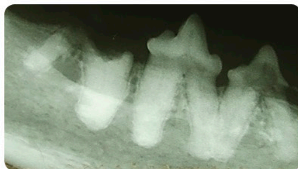
Radiograph of the above area showing retained and infected 1st molar tooth roots associated with the draining sinus. Also note tooth resorptions of right side mandibular 3rd and 4th premolar teeth seen as radiolucent areas within the teeth.†