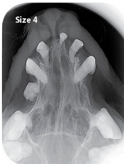
Canine nasal cavity