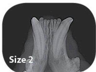
Feline lower incisors and canines