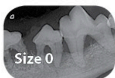
Lower mandible of small breed dog

Images shown below represent actual plate sizes